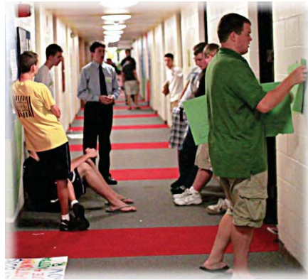
Michigan Boys Staters hang campaign posters.